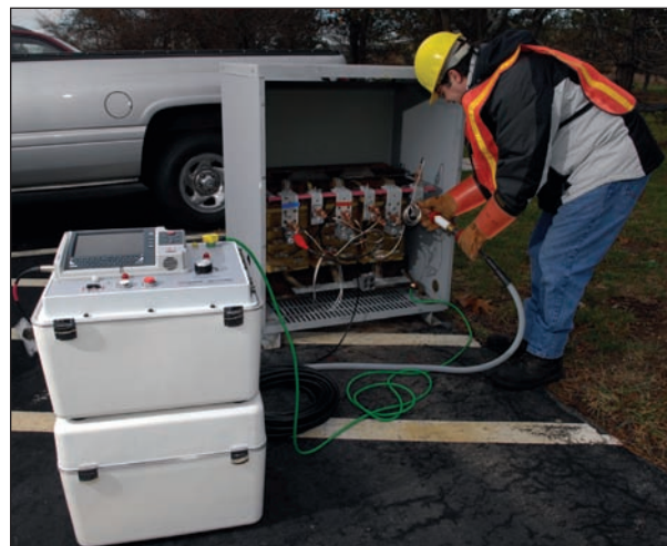
DELTA3000 shown testing a pad mount transformer

quantities include voltage, current, power (loss), power factor and capacitance. The operator has the option of correcting the current and loss readings to their 2.5 kV or 10 kV equivalents. Information can be downloaded directly to a PC or USB flash device, allowing the user to store up to 100,000 data sets. Printing is done via a second USB port directly to a USB thermal paper printer (included) allowing the user to print full-size test forms in either 8.5" x 11" or A4 size, without the use of an external laptop.