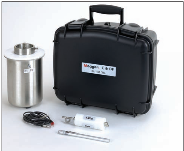
The optional Oil Test Cell, C/N 670511, is used for testing insulating fluids up to 10 kV