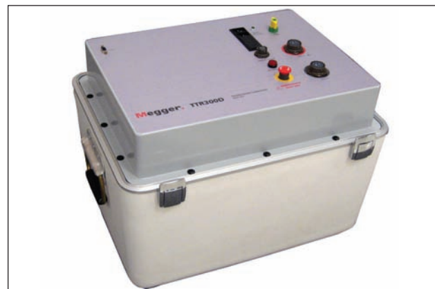
Optional TTR300D module, for LV three-phase TTR testing, installed inside DELTA HV cabinet. (Lid not shown for clarity.) PowerDB ONBOARD controls the TTR300D module, providing all the benefits as referenced in the Megger TTR330 product specifications.