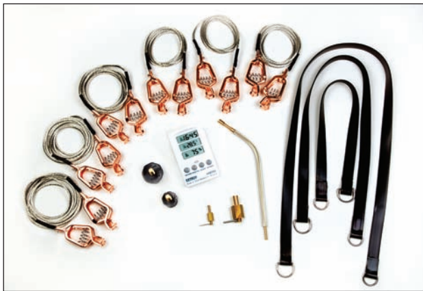
The optional accessory kit, C/N 670501 includes mini bushing tap connectors, hot collar straps, temperature/humidity meter, .75" bushing tap connector, 1" bushing tap connector, "J" probe bushing tap connector, 3-ft non-insulating shunting leads, 6-ft non-insulating shunting leads