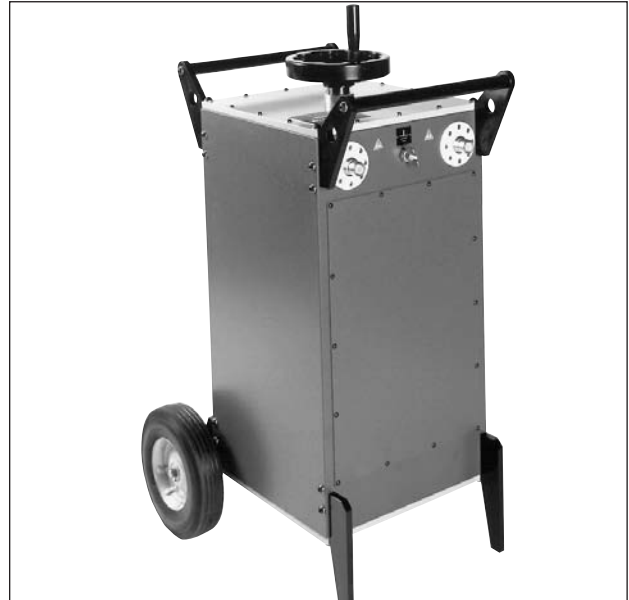
The optional Resonating Inductor expands the capacitance range of the DELTA3000