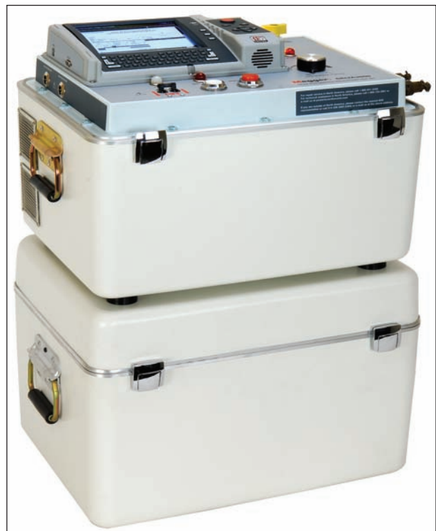
The DELTA3000, available in either 120 or 240 V ac/50 or 60 Hz, includes the Control Unit (top) and High Voltage Unit (bottom)