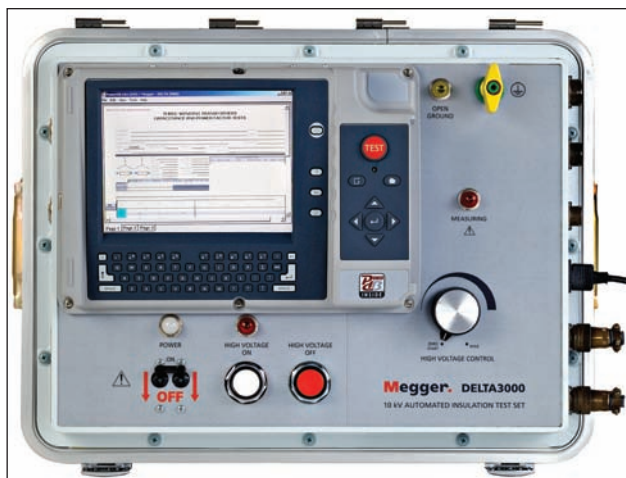
Close-up of DELTA3000 panel