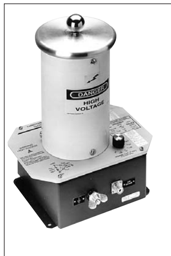
The optional Calibration Standard traceable to the NIST for quick operating or calibration checks of test set bridges calibrated in watts loss or in dissipation factor