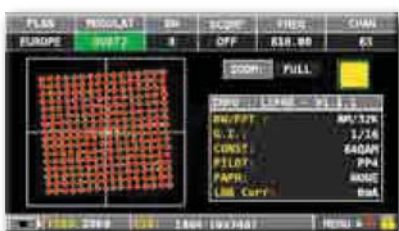
DVB-T2 rotated Constellation 256 QAM mod., on the right relative modulation parameters & M-PLP