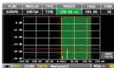
ECHO MEASUREMENT in SFN networks, with impulse response in real time, green area shows the guard interval