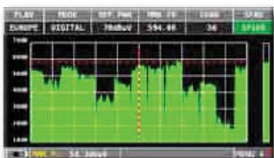
Spectrum TV 100 MHz span