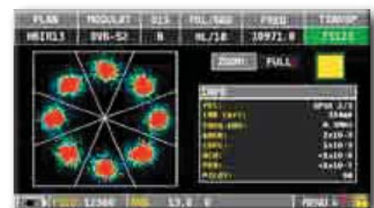
DVB-S2 multistream Constellation 8PSK mod., on the right relative modulation parameters & ISSY