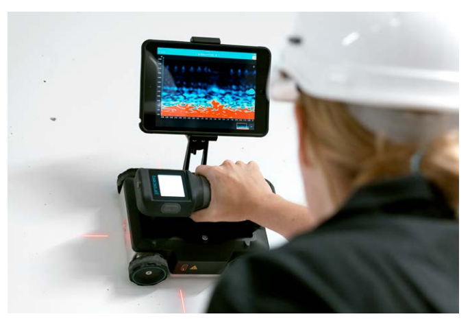
Proceq GPR Live combined with the device tablet holder

Proceq GPR Live is a groundbreaking product that offers a wide selection of accessories to fit every user's needs, such as the on-device tablet holder for single-hand operation and the telescopic rod for accessing hard-to-reach areas. Unlike other GPR products, its flexible set-up allows the user to always have a large screen at an optimal viewing position with all controls within easy reach.