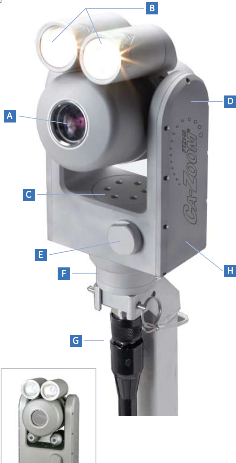
PTZ 140 with optional laser accessory

With the Ca-Zoom® 6.2 Digital Inspection System™, GE Inspection Technologies now offers three camera head options to enable you to increase your inspection capabilities from one base platform. Built-in control functions and advanced iVIEW™ image management platform are all packaged into one unit.