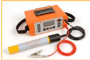
Elcometer 3312 with Half-Cell & memorv