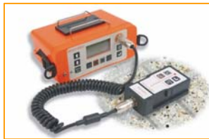
Elcometer 3312 B Covermeter

Elcometer 3312 Covermeters with Half-Cell allow users to not only identify the location, orientation, depth and diameter of stainless steel rebar, but also the potential for corrosion all in one easy-to-use gauge.