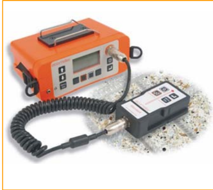
Elcometer 331 2 Covermeter with Half-Cell

This easy to use gauge not only quickly and accurately identifies the location, orientation, depth and diameter of rebar, but also the potential for corrosion.